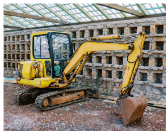
Boom height & cab swing limit indicator