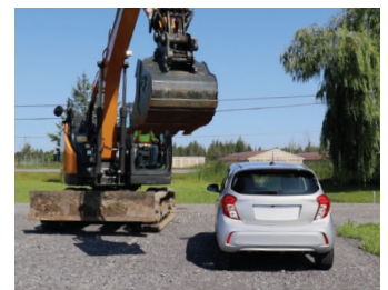
The system slows the machine near the danger zone.