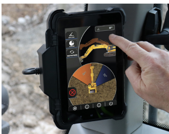
User friendly and rugged 5 inches Android tablet for maximal visibility