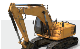
Excavator and Wheel excavator

Combine with the range limiting system LIMIT-Pro in the same tablet